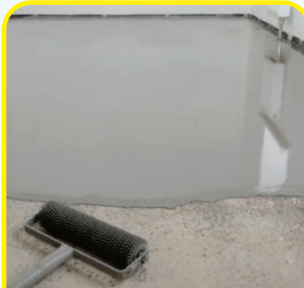
CONCRETE SELF LEVELING