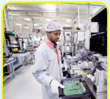
ELECTRONIC AND IT INDUSTRIES