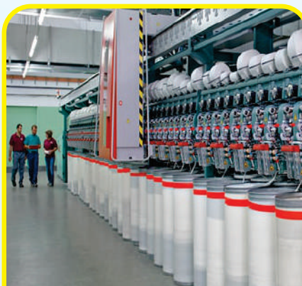
TEXTILE PROCESSING INDUSTRIES