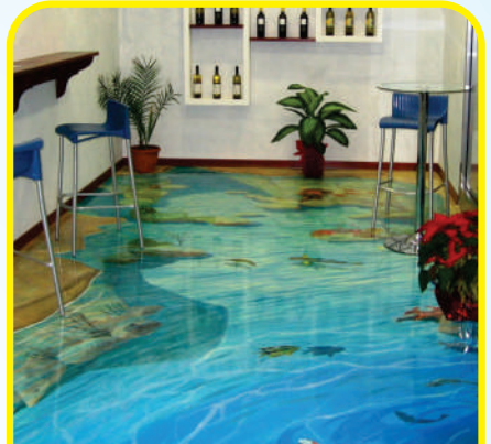
EPOXY 3D FLOORING