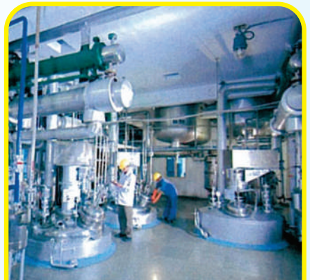
PHARMA AND FOOD INDUSTRIES