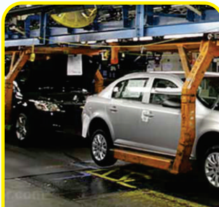
CAR PARKING COATING